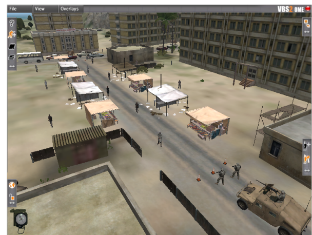
Figure 2. Layout of the example's market area.

In the SB scenario, the SB walks into a crowded market area; a BLUFOR patrol is observing the scene. The SB's goal is to destroy the BLUFOR unit by detonating the bomb he is carrying. In a variant of this scenario, the SB's goal is to maximise the civilian casualties. A diagram of the layout is shown in Figure 2.